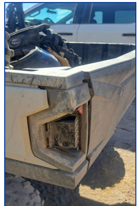
Top – The dirt road where this incident occurred. Bottom – The UTV's broken taillight.